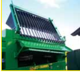
Hydraulic tipping grid on RT and TA machines.