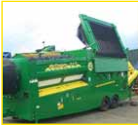
Tandem wheeled chassis.