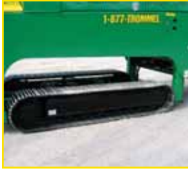
Track chassis with hydraulic raise and lower.