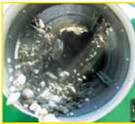
Various drum and screen combinations.